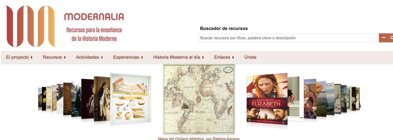
Figure 1. Modernalia Home

Modernalia is a project developed and driven by the Seminario de Historia Social de la Población (SEHISP) in the University of Castilla – La Mancha. It involves national professors and university researchers from Early Modern History, Didactics on Social Sciences, Geography, History and Art History professors from Secondary Education and other national education levels. The aim is to provide digital resources about Early Modern History to the education community and interested people in this historical age. The educational and research possibilities are numerous. Besides, it is a quality and methodological teaching improvement.